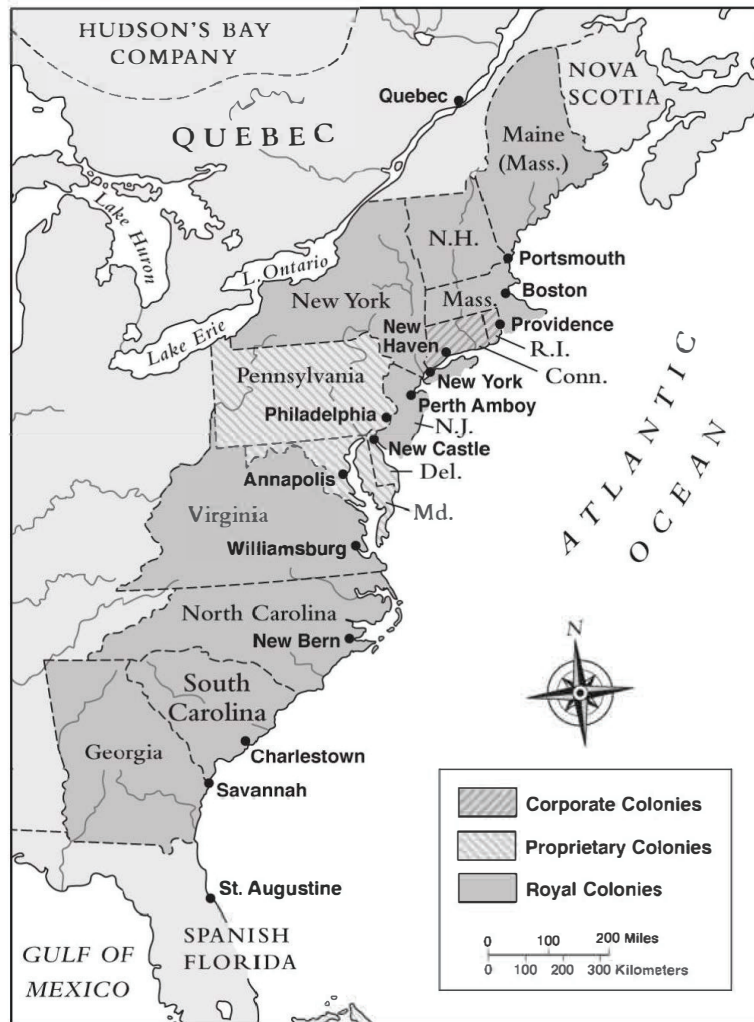
THE THIRTEEN ENGLISH COLONIES AROUND 1750

As a reward for helping him gain the throne, Charles II granted a huge tract of land between Virginia and Spanish Florida to eight nobles, who in 1663 became the lord proprietors of the Carolinas. In 1729, two royal colonies, South Carolina and North Carolina, were formed from the original grant.